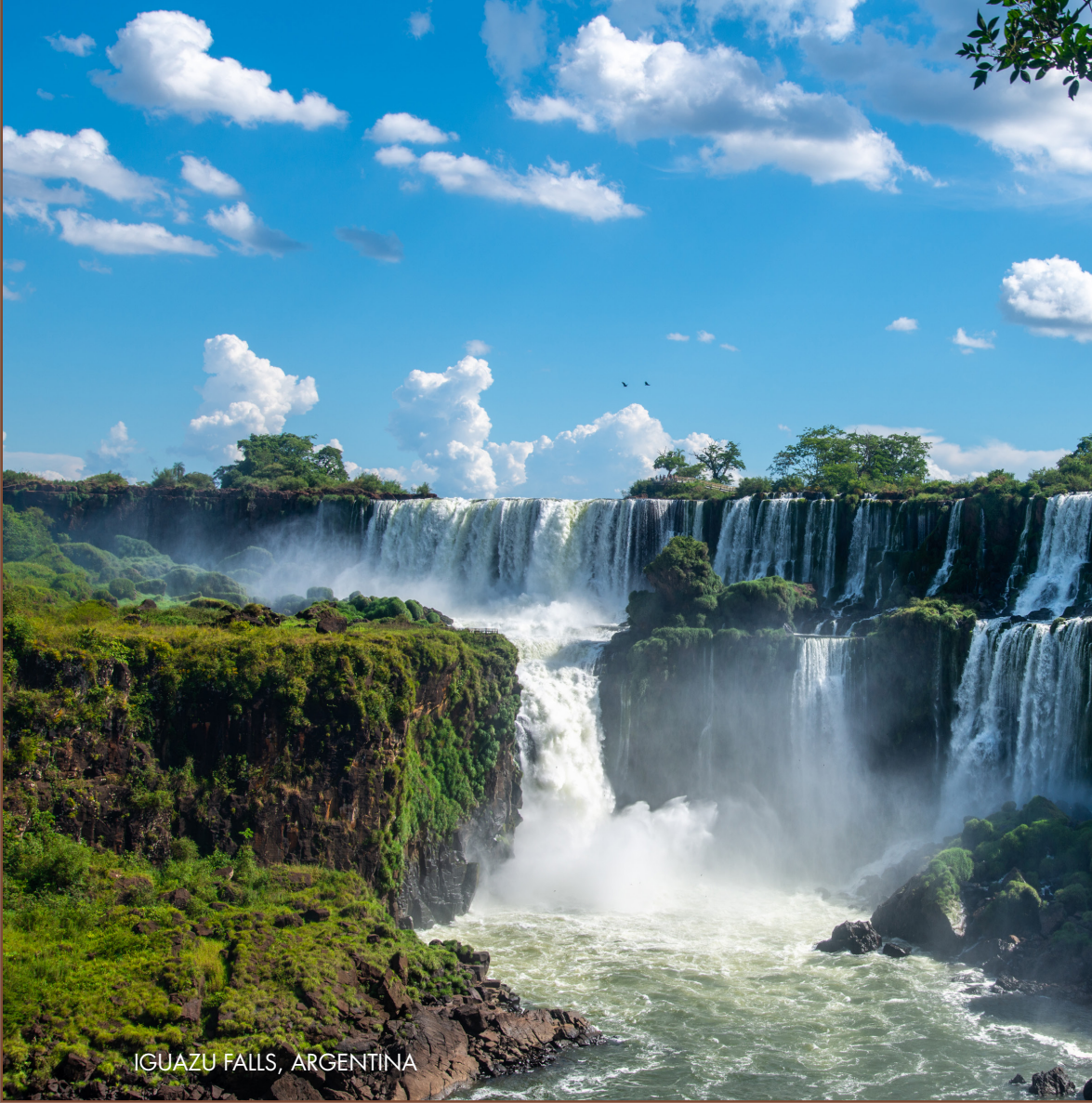
IGUAZU FALLS, ARGENTINA