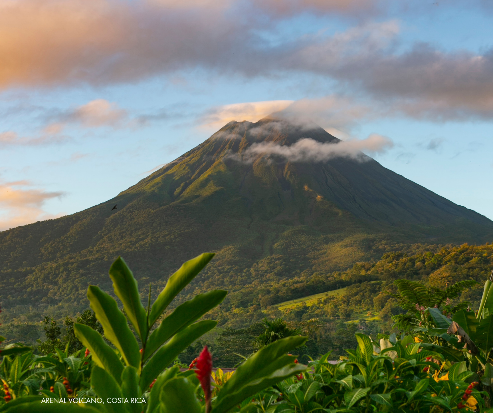
ARENAL VOLCANO, COSTA RICA