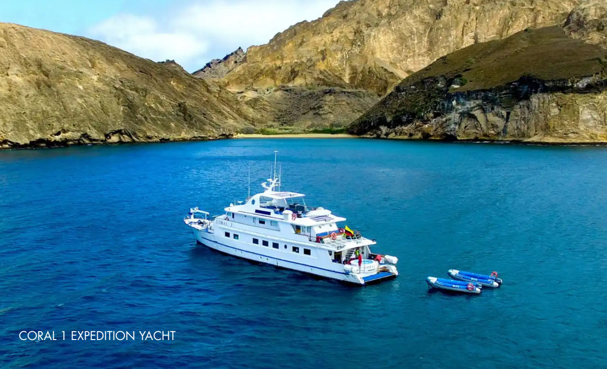
CORAL 1 EXPEDITION YACHT