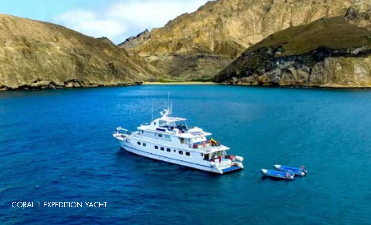
CORAL 1 EXPEDITION YACHT