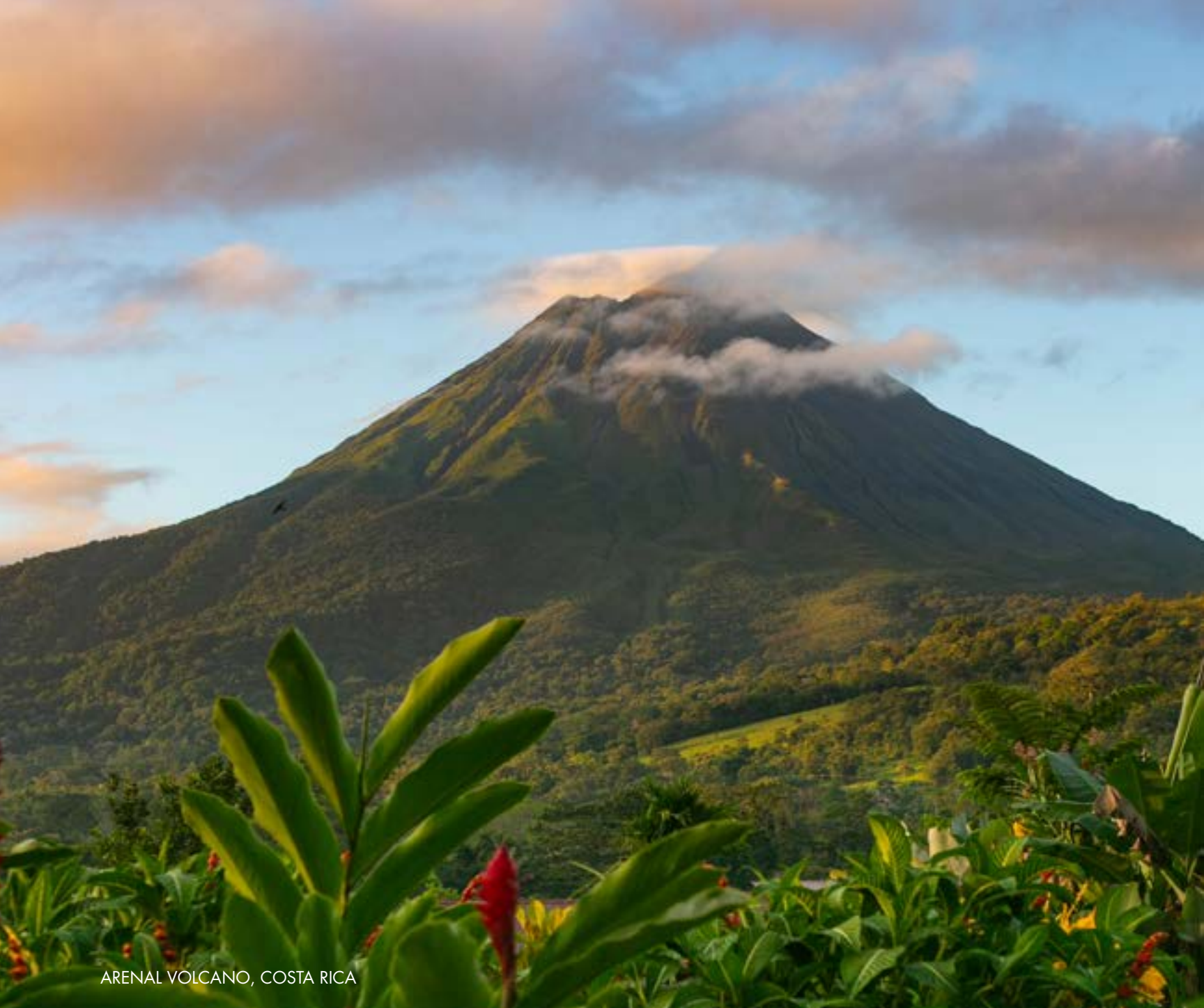
ARENAL VOLCANO, COSTA RICA