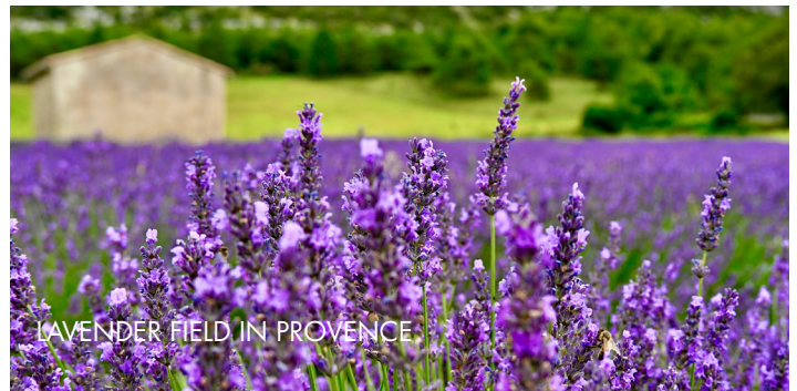
LAVENDER FIELD IN PROVENCE

Enjoy breakfast at the hotel before transferring to the Nice airport for your flight home to Canada, arriving the same day. Your private driver will assist with luggage and drive you home. What a beautiful journey through France's vineyards, villages and vistas! (B)