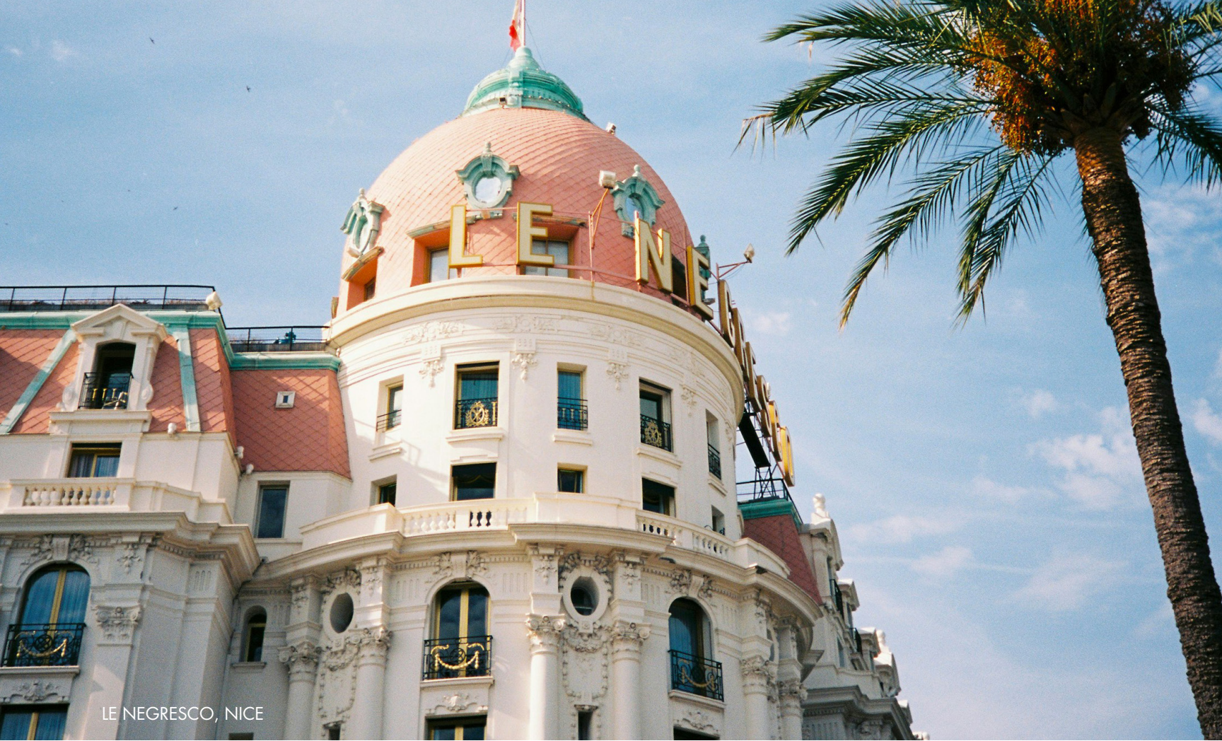
LE NEGRESCO, NICE