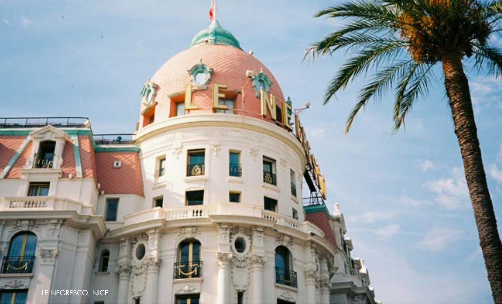
LE NEGRESCO, NICE