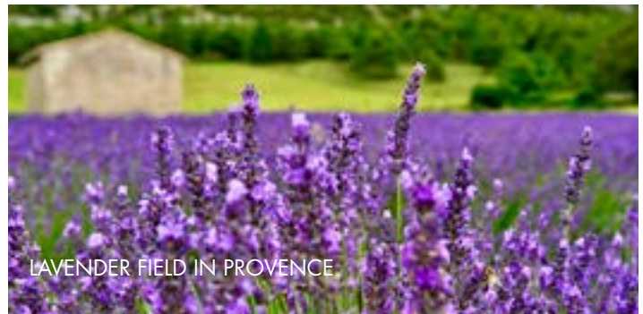
LAVENDER FIELD IN PROVENCE

Enjoy breakfast at the hotel before transferring to the Nice airport for your flight home to Canada, arriving the same day. Your private driver will assist with luggage and drive you home. What a beautiful journey through France's vineyards, villages and vistas! (B)