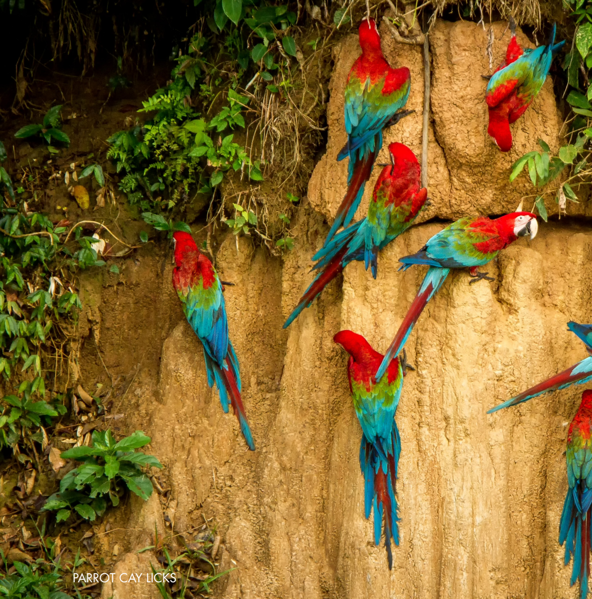
PARROT CAY LICKS