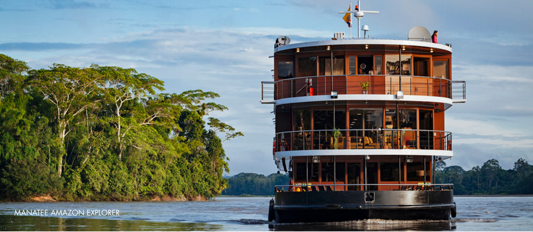
MANATEE AMAZON EXPLORER