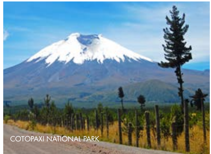
COTOPAXI NATIONAL PARK

Set out by motorized canoe to witness hundreds of parrots and macaws descending on the clay licks — one of the region's most breathtaking natural spectacles. Return on board for lunch, then visit the Kichwa Cultural Centre, where you'll meet members of the local community, gain insight into their traditions and daily life, and experience their deep connection to the rainforest through stories, crafts and customs. Dinner and overnight on board. (B,L,D)