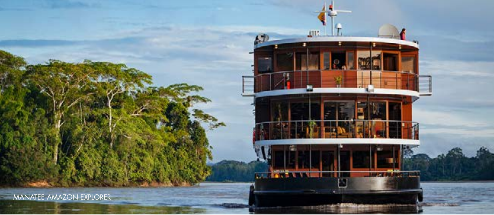
MANATEE AMAZON EXPLORER