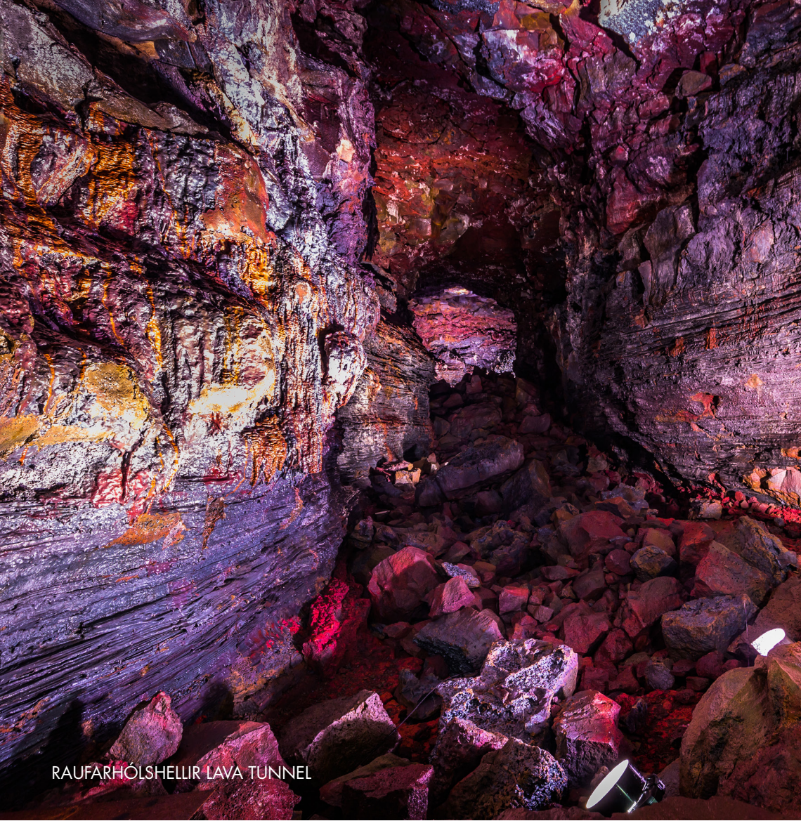
RAUFARHÓLSHELLIR LAVA TUNNEL