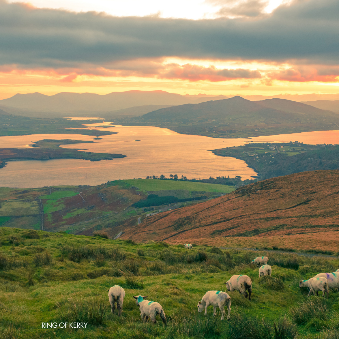
RING OF KERRY