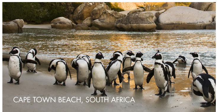
CAPE TOWN BEACH, SOUTH AFRICA

After breakfast, make your way to the airport for your return flight to Johannesburg. Still in awe, say goodbye to your fellow travellers who opted out of our included group flights and embark on your return flights to Canada, arriving the next day. Your driver will meet you at the airport to help you with your luggage and drive you home. What a truly amazing experience! (B,L)