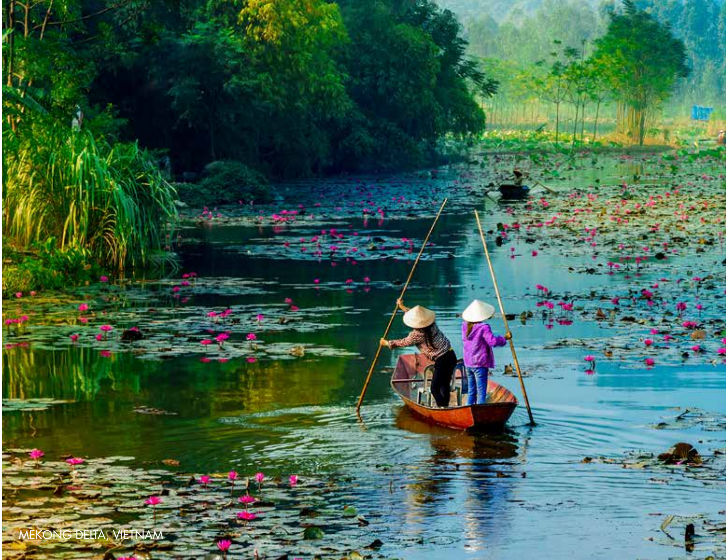
MEKONG DELTA, VIETNAM