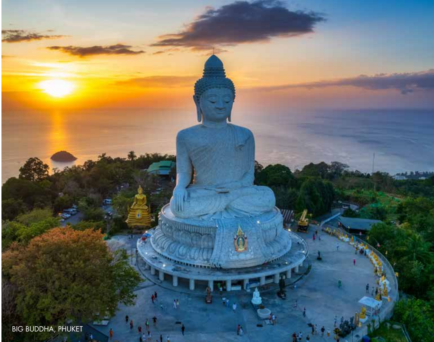
BIG BUDDHA, PHUKET