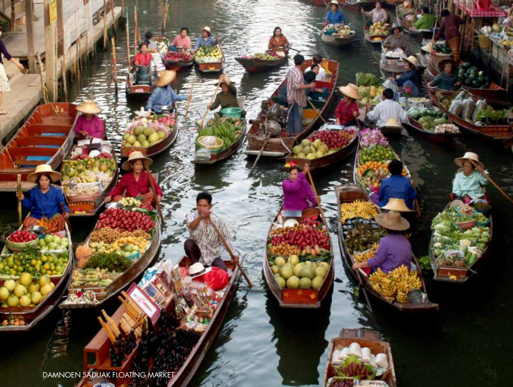
DAMNOEN SADUAK FLOATING MARKET

Life is never black & white: but today is an exception! Begin your day with a visit to the Baan Dam Museum, an unconventional art museum made up of 40 black houses that feature eclectic contemporary art. Next, make your way to Wat Rong Khun, a stunning white temple covered in glass that shimmers in the sunlight. Travel to Chiang Mai and spend the afternoon at your leisure before hopping into a colourful Tuk-Tuk for a tour of the city, including a stop to see Wat Lok Molee. We'll be breaking for authentic Thai food in the Chang Puak Gate night market, one of the best places to savour all the sights, flavours and smells that Thai cuisine has to offer. Wind down with a drink and a view a rooftop restaurant before returning to your hotel. Overnight in Chiang Mai. (B,L,D)