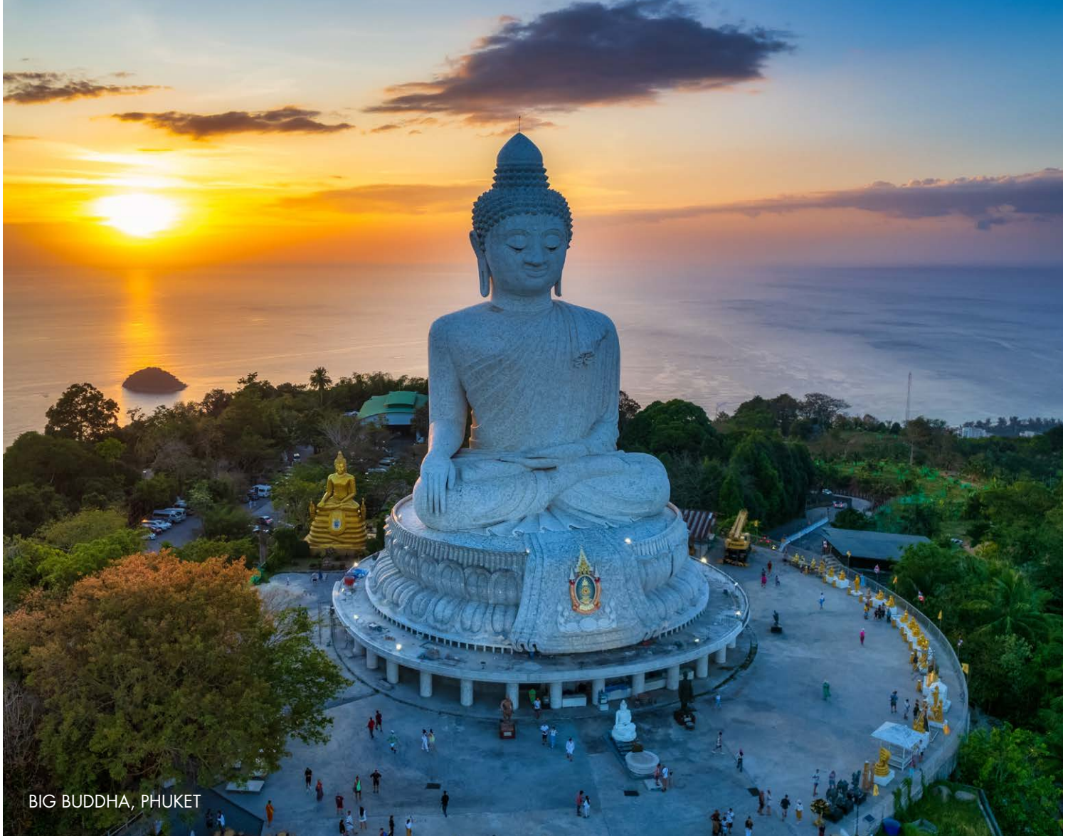
BIG BUDDHA, PHUKET