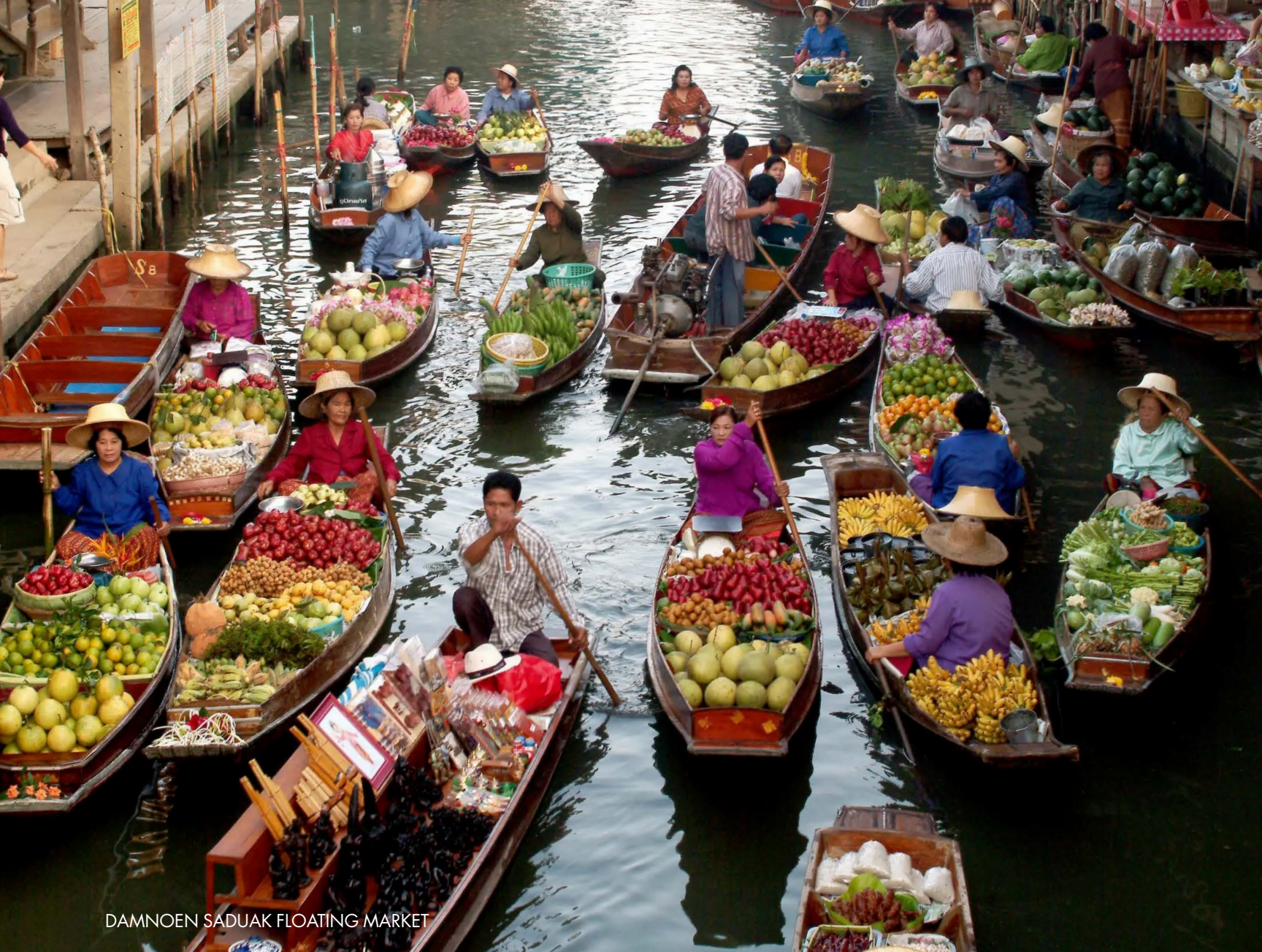
DAMNOEN SADUAK FLOATING MARKET