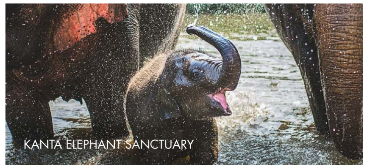
KANTA ELEPHANT SANCTUARY

Make some majestic new friends by joining us on a visit to the Kanta Elephant Sanctuary. After learning about their unique habits and personalities, you'll get the opportunity to feed and play with these gentle giants. Walk alongside your new friends to a local watering hole, and snap a photo while they shower themselves with their powerful trunks. In the afternoon, experience a traditional Thai massage before partaking in a crash course in Thai tastes with a visit to a local organic farm. After getting your hands dirty in the tranquil garden, test your skills in the kitchen by creating your own curry dish during a traditional cooking class. Overnight in Chiang Mai. (B,L,D)