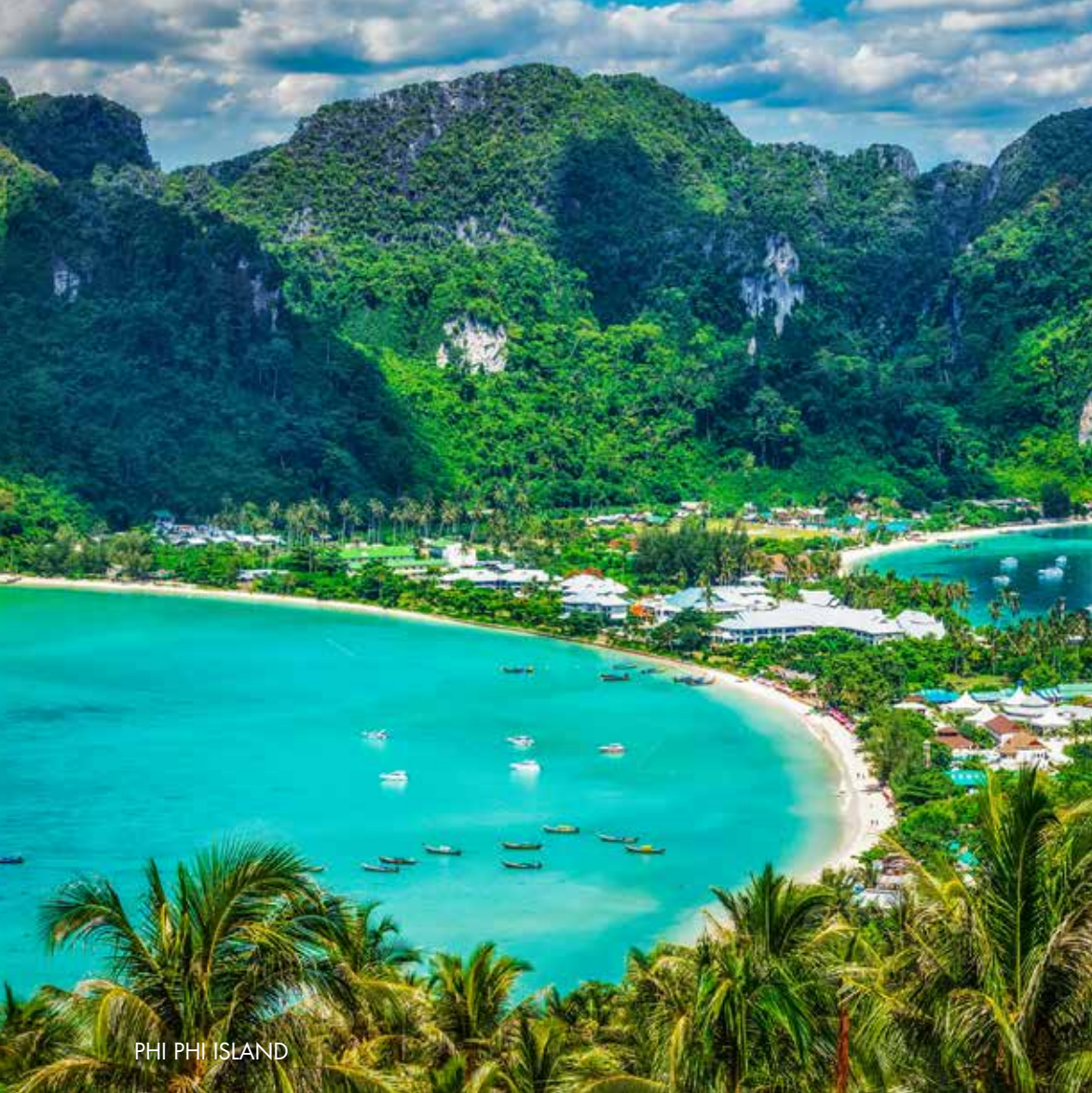
PHI PHI ISLAND