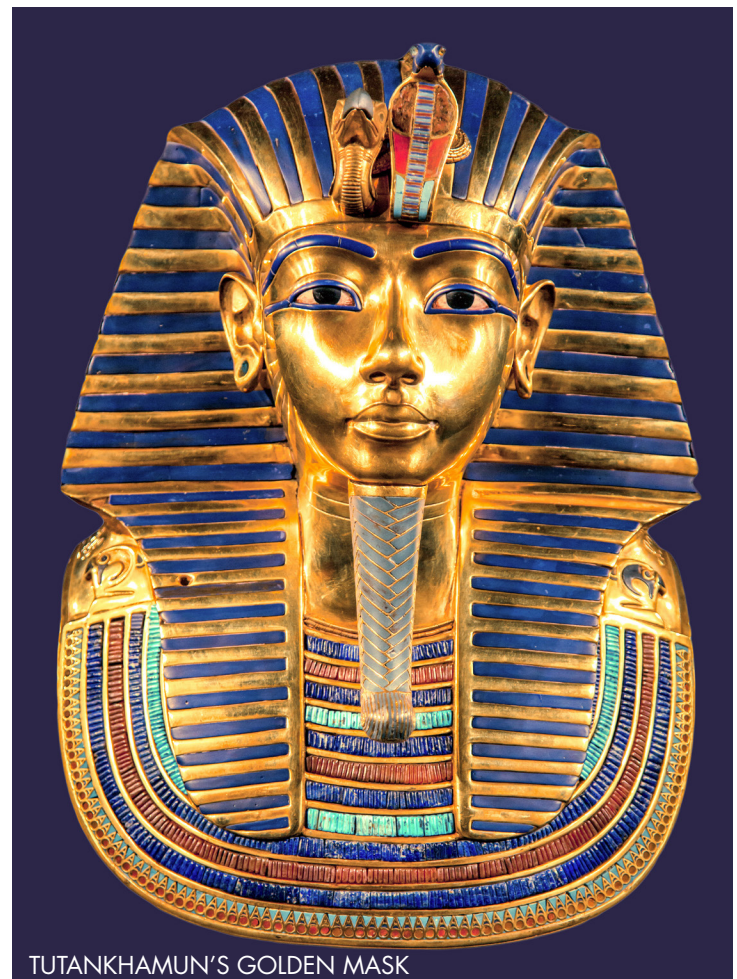
TUTANKHAMUN'S GOLDEN MASK

Enjoy breakfast on board before departing for the Valley of the Queens and Valley of the Kings, the burial site of many pharaohs and their wives. 62 tombs are known to exist in the Valley of the Kings and you'll have the