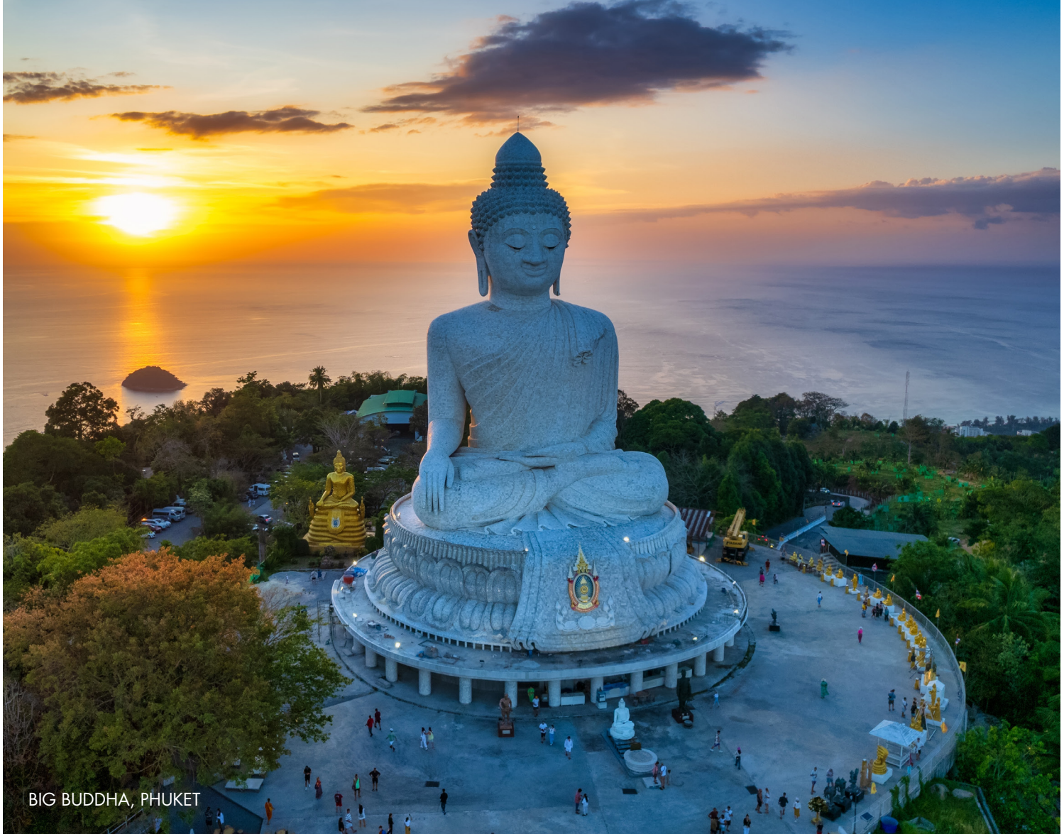
BIG BUDDHA, PHUKET