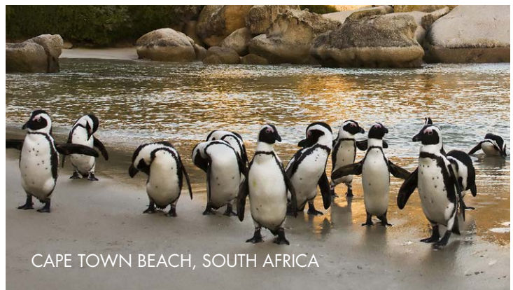
CAPE TOWN BEACH, SOUTH AFRICA

After breakfast, make your way to the airport for your return flight to Johannesburg. Still in awe, say goodbye to your fellow travellers who opted out of our included group flights and embark on your return flights to Canada, arriving the next day. Your driver will meet you at the airport to help you with your luggage and drive you home. What a truly amazing experience! (B,L)