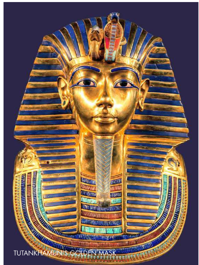
TUTANKHAMUN'S GOLDEN MASK

Fly from Cairo to Luxor, one of the oldest inhabited cities in the world. Luxor is known as the 'greatest open-air museum', and you'll understand why once you see the monuments, temples and tombs that line the ancient avenues of this city. Board the ship which will be your home for the next seven nights as you embark on your cruise of the Nile. Lunch and dinner on board. (B,L,D)