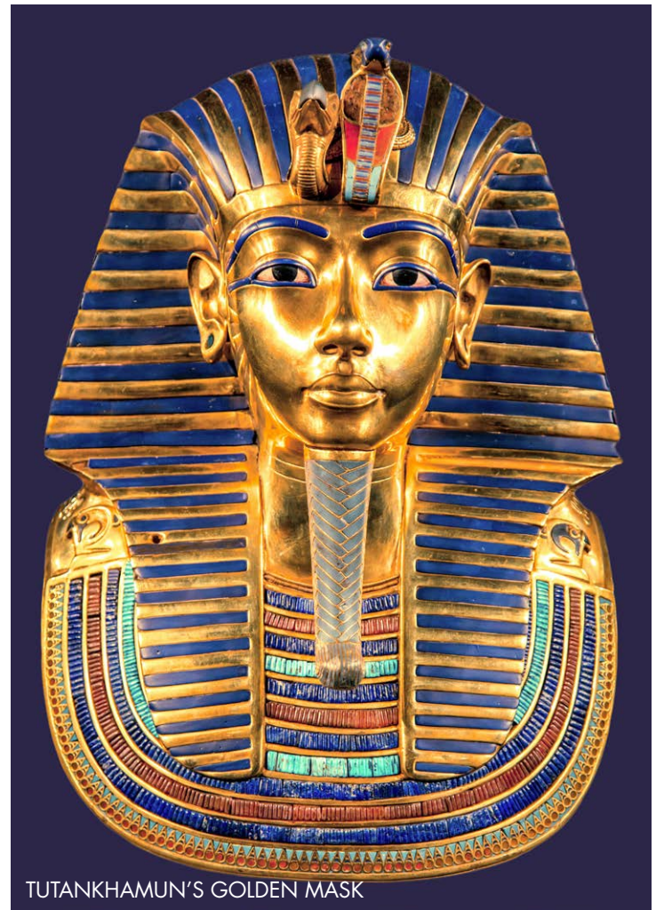
TUTANKHAMUN'S GOLDEN MASK

Enjoy breakfast on board before departing for the Valley of the Queens and Valley of the Kings, the burial site of many pharaohs and their wives. 62 tombs are known to exist in the Valley of the Kings and you'll have the