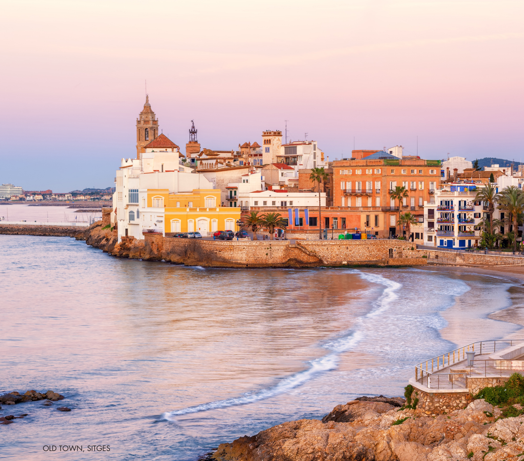
OLD TOWN, SITGES