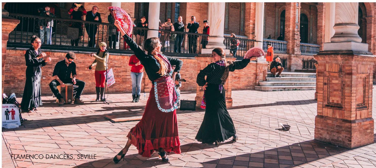
FLAMENCO DANCERS, SEVILLE

Immerse yourself in Córdoba's rich tapestry during our morning walking tour. With each step, weave between traditional Castile-style squares lined with sandstone, surrounded by ornate homes and shops topped with terracotta. Explore the Great Mosque-Cathedral, a unique blend of Islamic and Christian architecture. Pass through the old Jewish Quarter and enter the fortress-palace of Alcázar de los Reyes Cristianos. Following lunch, take the afternoon to explore this diverse city at your leisure. Overnight in Córdoba. (B,L,D)