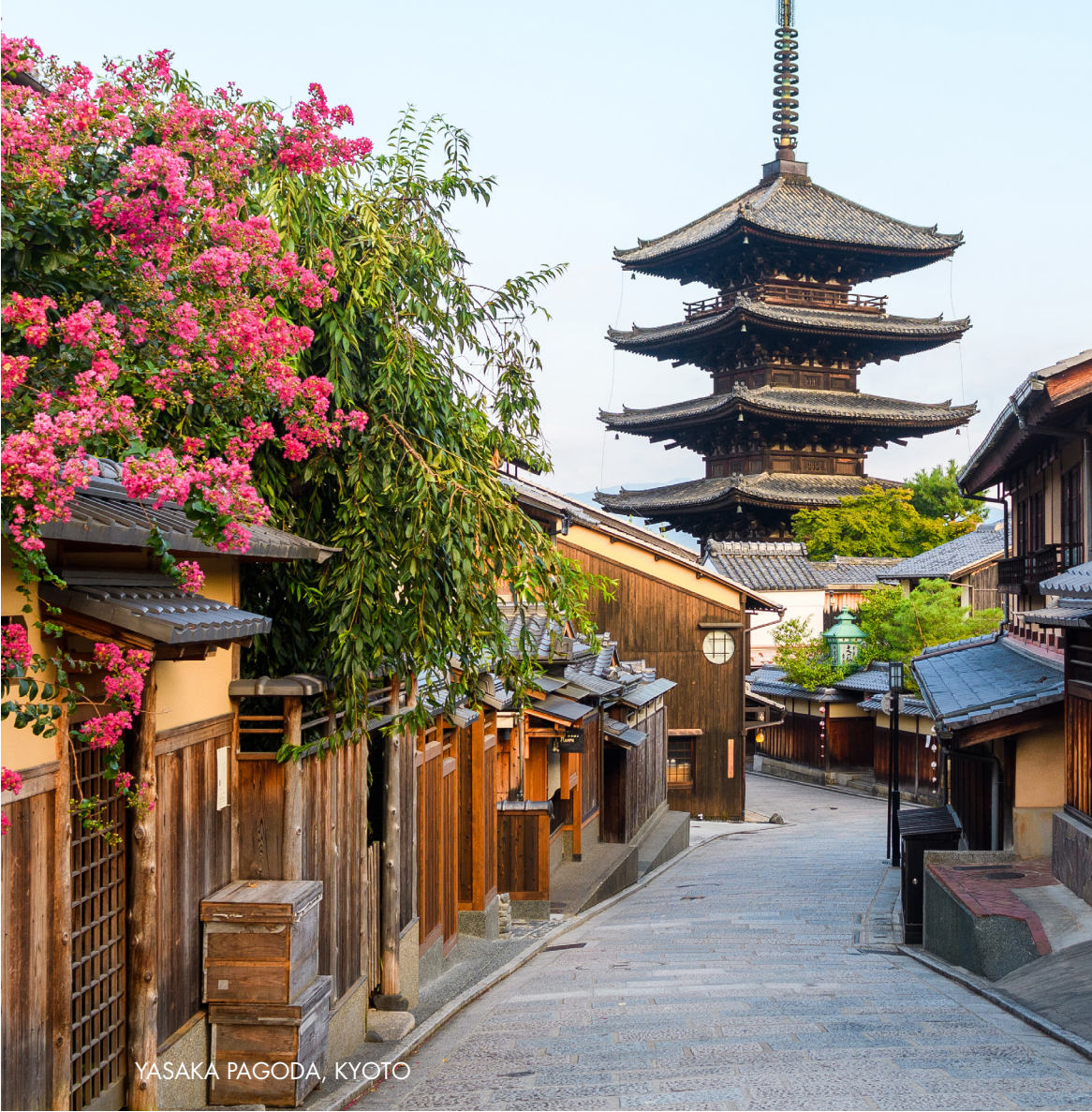
YASAKA PAGODA, KYOTO