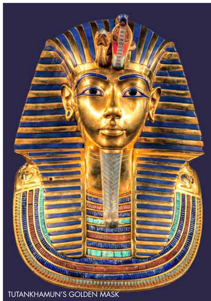
TUTANKHAMUN'S GOLDEN MASK

Enjoy breakfast on board before departing for the Valley of the Queens and Valley of the Kings, the burial site of many pharaohs and their wives. 62 tombs are known to exist in the Valley of the Kings and you'll have the