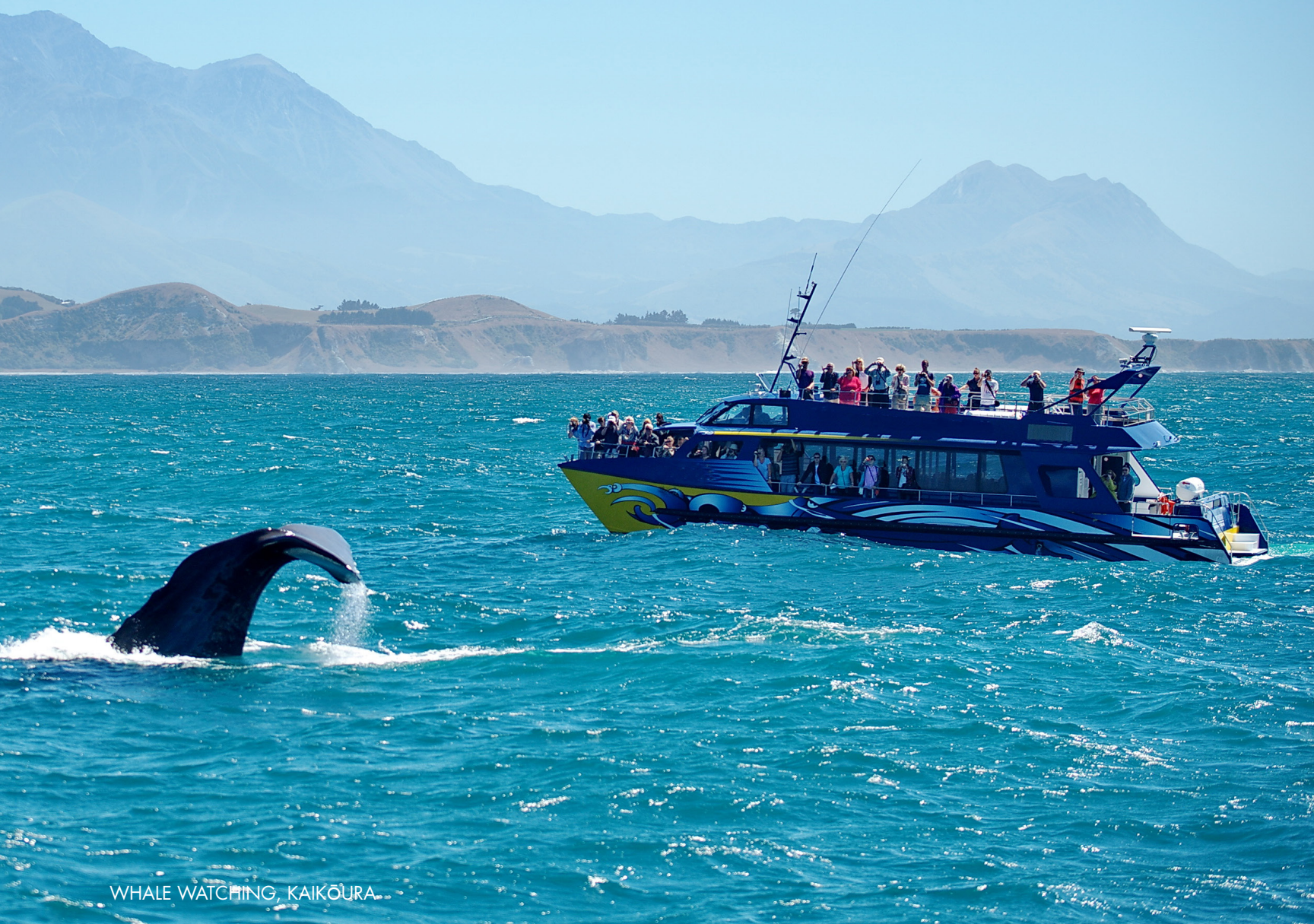
WHALE WATCHING, KAIKŌURA